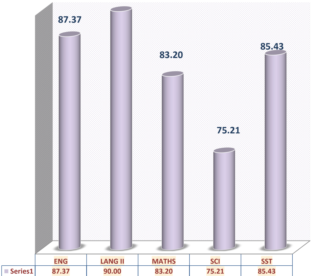
SUBJECT AVERAGE % 90.00